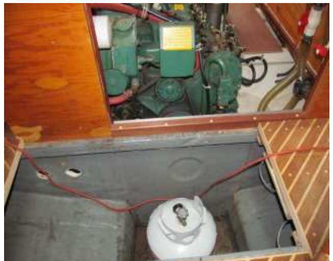
20lb. propane tank in bilge