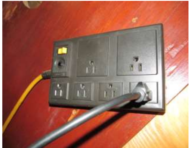
Outlet multiplier #10