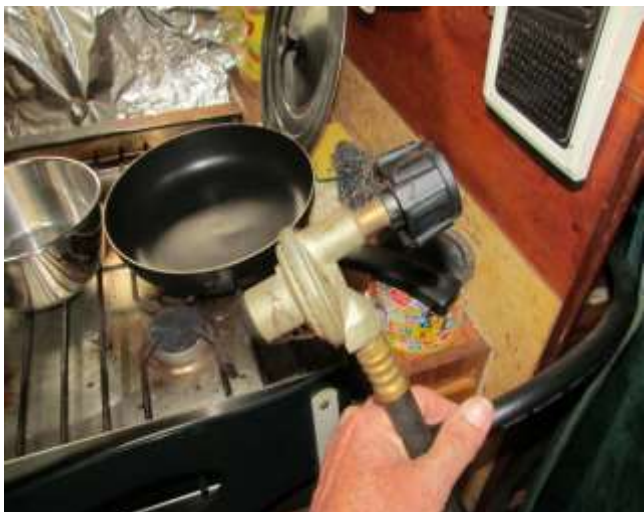
Propane line and regulator near galley