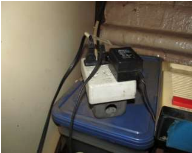
Outlet multiplier #9