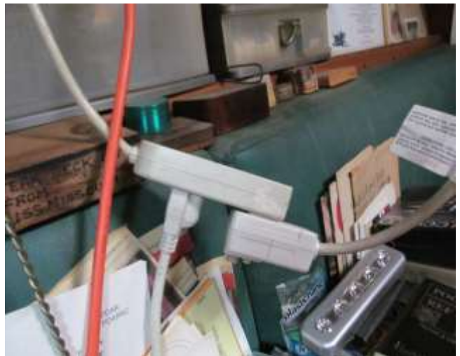
Outlet multiplier #6