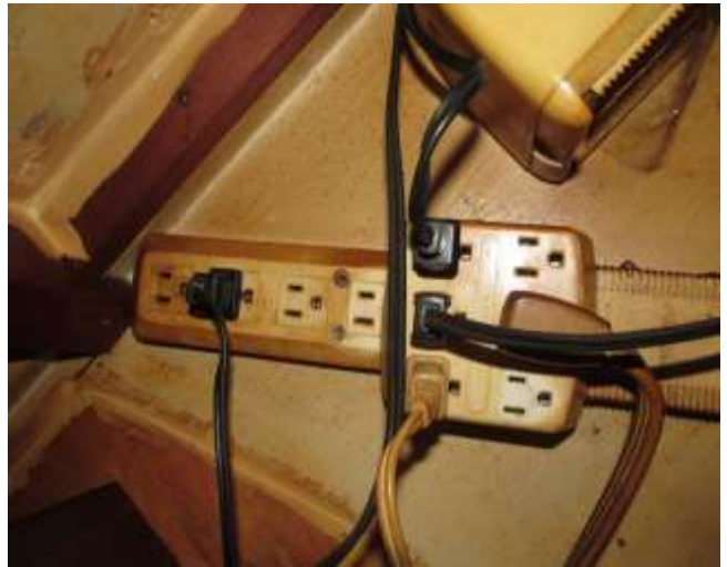
Outlet multiplier #2 & #3