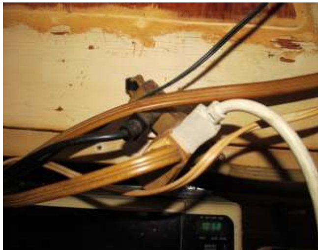
Outlet multiplier #4 & #5