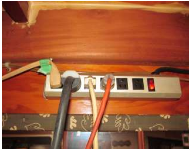
Outlet multiplier #1