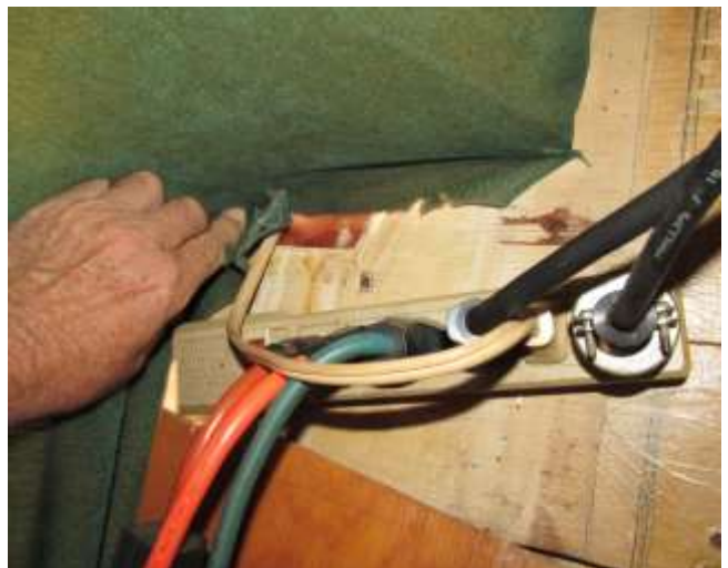
Outlet multiplier #8