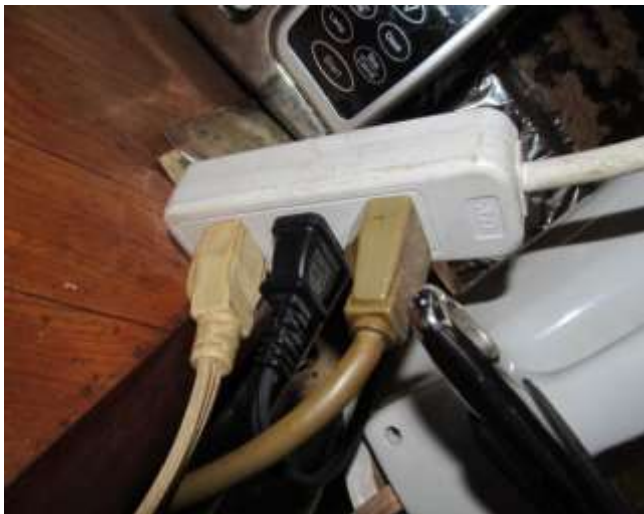
Outlet multiplier #11