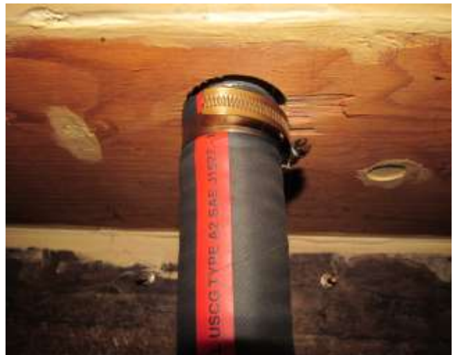
One of three ungrounded fuel fill connections