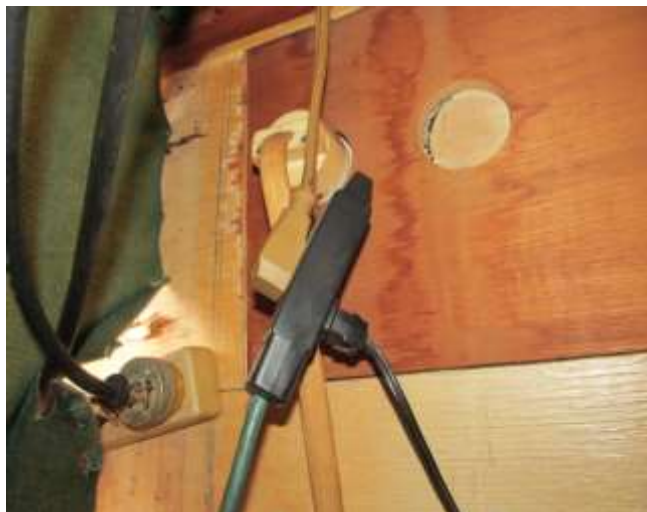
Outlet multiplier #7