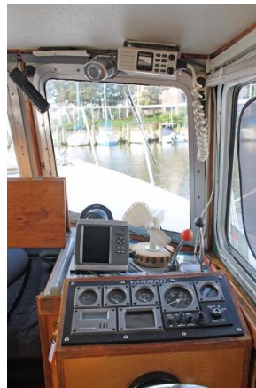
Maple Bay 27 - helm controls