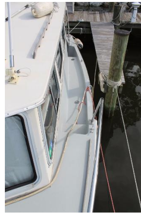
Maple Bay 27 - side deck