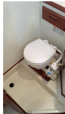
Maple Bay 27-shower pan in head