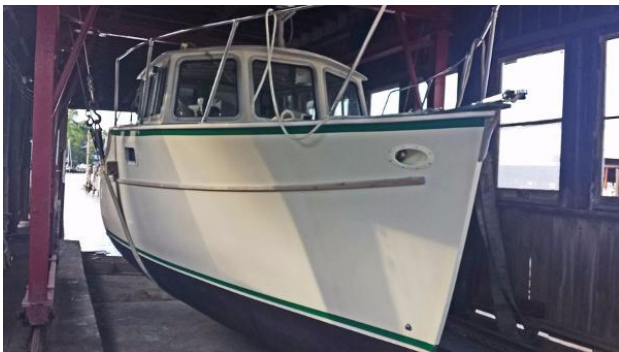
Maple Bay 27