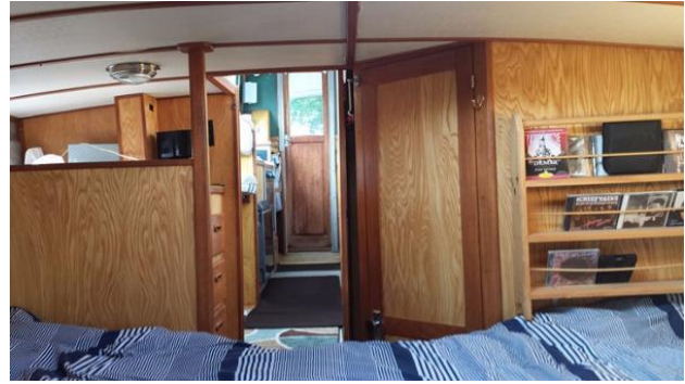
Maple Bay 27- V-berth looking aft