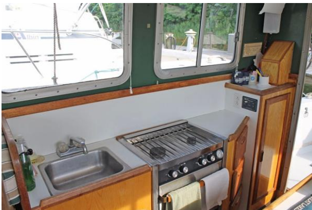
Maple Bay 27 - galley