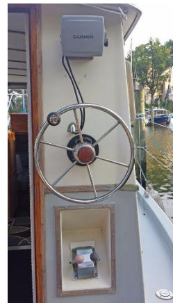
Maple Bay 27 - Aft Stbd controls