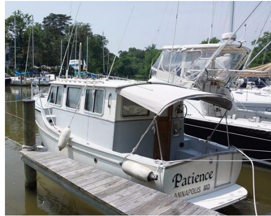
Maple Bay 27