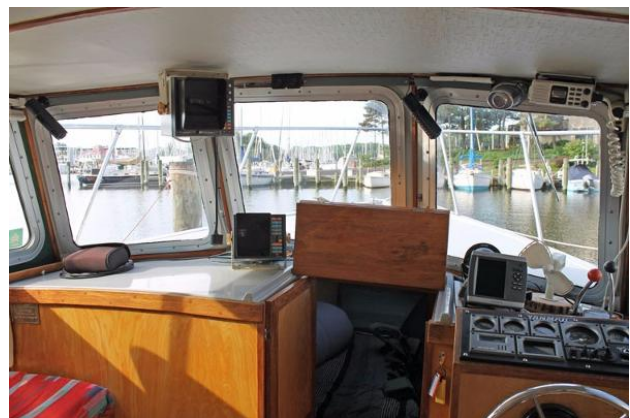
Maple Bay 27 - looking forward