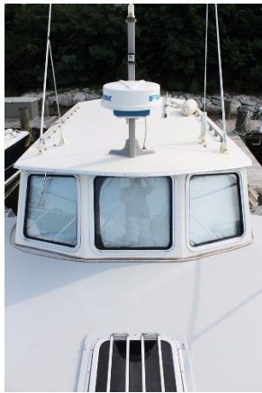
Maple Bay 27 - front windows w/ covers