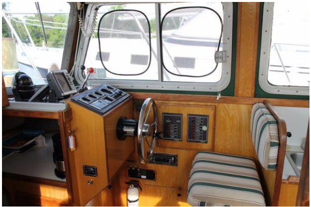
Maple Bay 27 - Helm seating