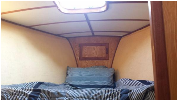
Maple Bay 27 -V-berth