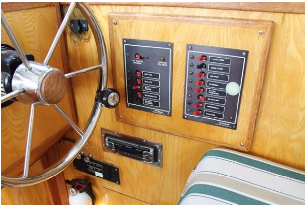
Maple Bay 27 - Helm