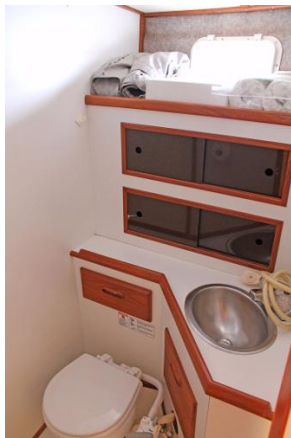
Maple Bay 27 - Head