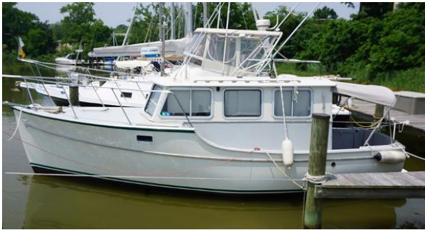
Maple Bay 27