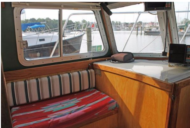
Maple Bay 27 - Helm bench