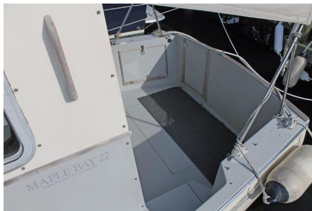
Maple Bay 27- cockpit