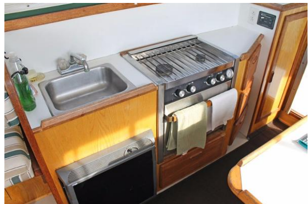
Maple Bay 27 - Galley