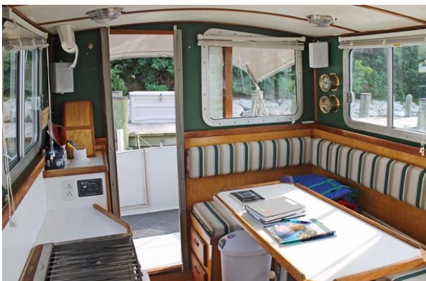
Maple Bay 27 - Galley, Salon/Dinette, looking aft