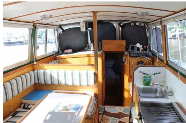
Maple Bay 27 - Galley, Salon/Dinette, looking forward