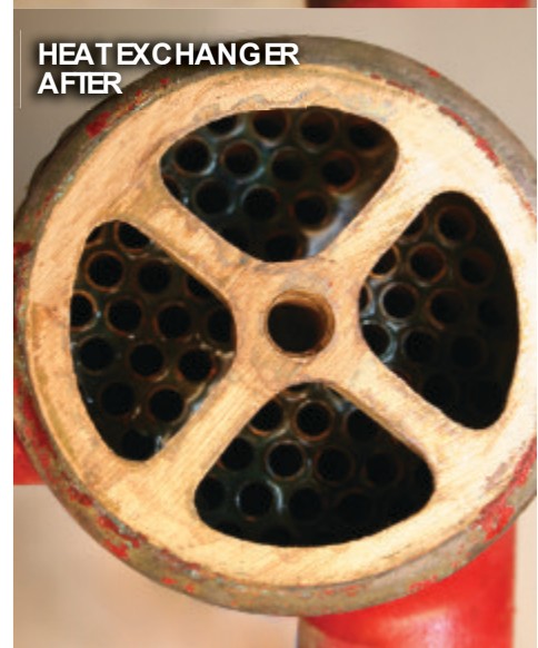
HEAT EXCHANGER AFTER