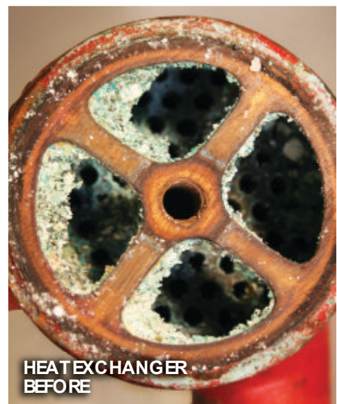
HEAT EXCHANGER BEFORE

Use RYDLYME Marine on recreational boats, such as cabin cruisers, power boats, yachts, mega-yachts, jet skies and more!