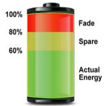
Figure 1 illustrates the breakdown of a battery that includes capacity fade and spare capacity. Adding 20 percent for fade and 20 percent for spare as a safety net leaves only 60 percent for the actual capacity. Such a generous allowance may not be practical in all cases.